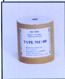
Replacement filter. Used filters are disposable as normal industrial waste.