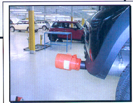
MF100 filter in use at a car assembly plant.

A compact, highly effective and versatile exhaust filter unit designed for use on vehicles being started or moved within an enclosed environment.